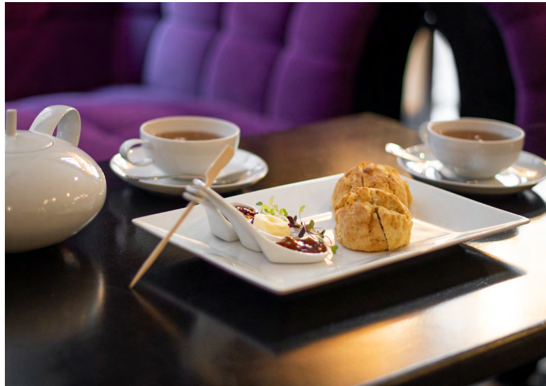
_ LISBONENSE BAR