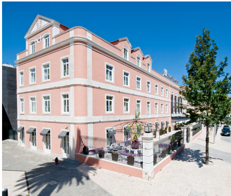
_ ENTRANCE FACADE

Inserted in the Silver Coast, the SANA Silver Coast is ideally positioned to navigate easily the charming region.