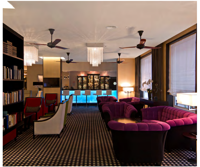
_ LOBBY / BAR