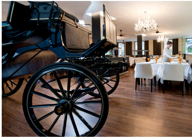
_ LISBONENSE RESTAURANT

In a palatial glamorous environment, the Lisbonense restaurant is a space of reference for all of those who appreciate genuine flavours, faithful to the traditions of Portuguese cuisine.